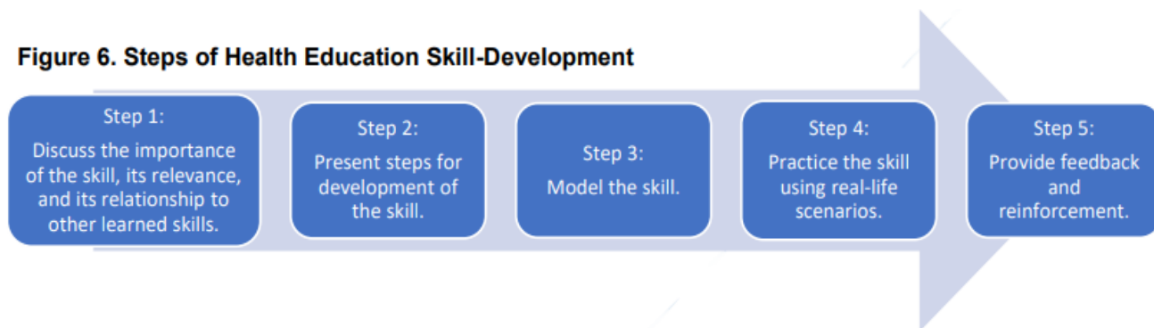
Figure 6. Steps of Health Education Skill-Development

Additionally, the National Health Education Standards and the World Health Organization (WHO) both provide models for skills development in health education. Figure 6 combines these two models and gives a framework for how each step is integrated into each skill taught in the curriculum. 13 Although the steps are listed in order, previous steps can be addressed at any time, as needed.