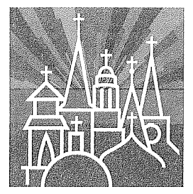
The Rhode Island State Council of Churches

100 Niantic Avenue, Suite 101 Providence, RI 02907 401-461-5558 Fax: 401-461-5233 riscc@councilofchurchesri.org www.councilofchurchesri.org