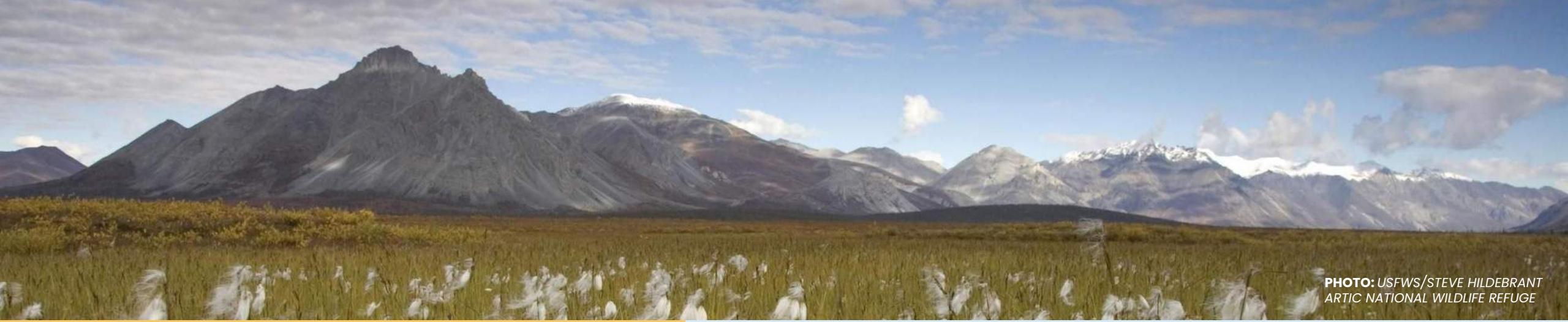
ARTIC NATIONAL WILDLIFE REFUGE