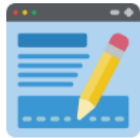
State Assessment Test Irregularity Report