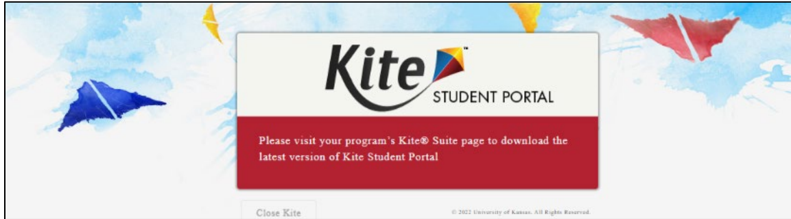
Kite Student Portal Error Message

Staff and educators have accounts in Kite Educator Portal (Figure 4).