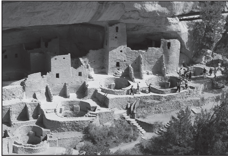
Cliff Palace, an ancient Anasazi dwelling, is part of Mesa Verde National Park in Southwestern Colorado.